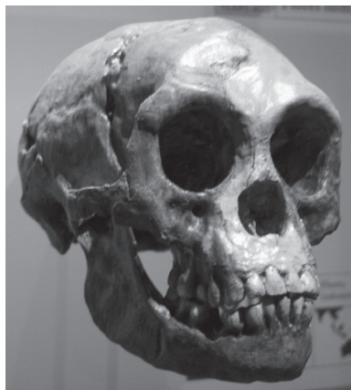
A cast of the fossil hobbit ( Homo floresiensis ) skull.