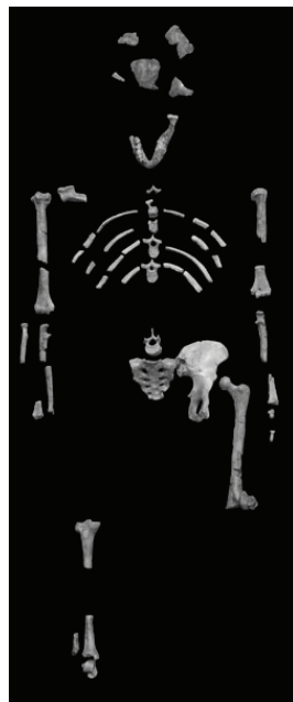
The skull pieces and other bone fragments of Australopithecus afarensis commonly referred to as Lucy.

A. afarensis sits at the base of a neat Y-shaped tree. Lucy, the Mother of Mankind, forms the stem, which branches off in one direction to Homo habilis , which in turn leads eventually to Homo sapiens , modern man. The other branch of the Y leads to Louis Leakey’s A. boisei and thence to extinction. This directly contradicted the Leakeys’ belief that the human line began much earlier. Thus were several lifetimes of work put on the line, and with some Leakey fossils used as ammunition against their own position. Also, Johanson thereby claimed the title to being finder of the missing link. 39