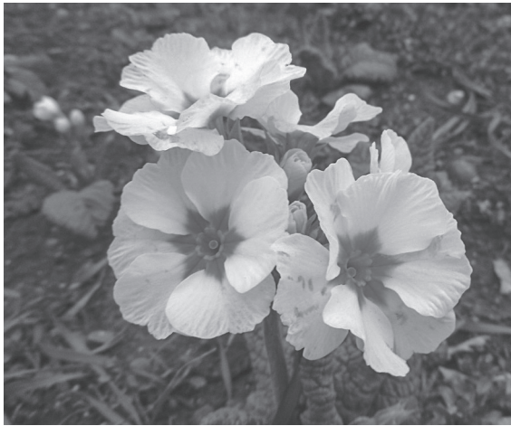
An evening white primrose, the plant that de Vries used for his research on mutations.

Further research revealed that de Vries' results were not due to mutations, but rather were a result of the fact that the evening primrose has an unequal chromosome number that caused hybrid plants to appear to produce new varieties. In fact, a rearrangement of existing genetic variation was the cause of the plant's new physical appearance, not mutations as de Vries postulated. Larson noted: " It created an initial stir in mutation theory, but within half a generation, interest in mutation theory had pretty well passed. It left a legacy and influence, however. " 47