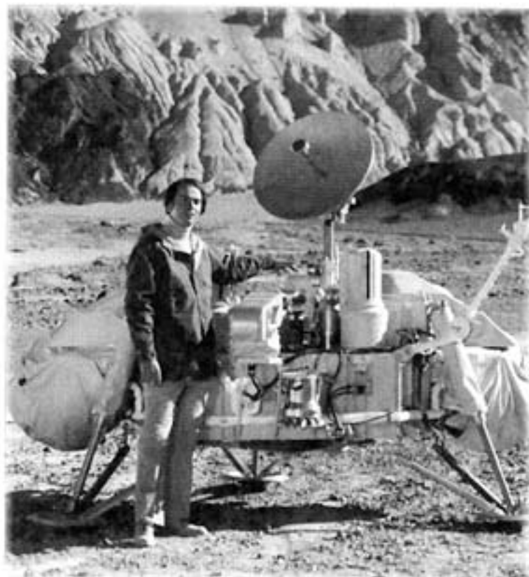
Sagan and Viking: Famous for his television series Cosmos, evolutionist Dr. Carl Sagan poses with a model of the Viking lander in Death Valley, California.

"Science" was my god. While philosophers and politicians struggled with less and less success over older and older questions, scientists conquered diseases and put mankind on the moon and were on the way to conquering aging and poverty and reaching onward to the stars! At age ten, I wrote a constitution for the first government of Mars, hoping I would be among the scientists leading the conquest of space. As a college freshman, I tried to found a new discipline, "experimental philosophy," convinced that science could finally determine what truly produced human happiness. In all this, I was considered a "nice guy" and actually felt sympathy for Christians who hoped for heaven and believed "love conquers all." But I wanted my students to realize that it was millions of years of struggle and death that had brought all life, including ours, into existence, and only science — not some god of our own imagination — could finally lead us past the