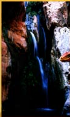
(Left) The tranquil falls of Elves Chasm

And yet, at the same time, we see God's handwork in the beauty and majesty