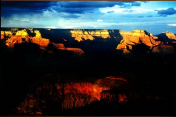
The solemn witness of Grand Canyon (David Toward)