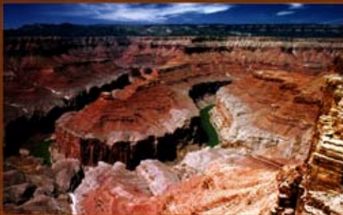
(Above) Paint Homburg, from the Emmerence River, Trail in Marble Canyon

The Grand Canyon, like every other major geographic feature of this planet, provides an eloquent, though silent, witness to the amazing fact that "...the world at that time was destroyed,