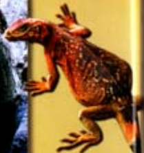
(Below) Chuckwallons can reach 16 inches in length