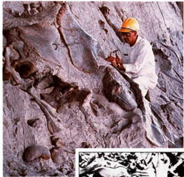
Dinosaur National Monument, Utah

Scientists agree that there was a drastic change of climate at one time in the earth's history, but they have many different reasons for it. Creationists believe that the Flood changed the earth's climate.