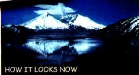
HOW IT LOOKS NOW