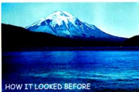
HOW IT LOOKED BEFORE