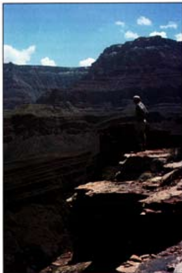
Figure 1.3 Grand Canyon commands our attention and prompts us to ask, "What mean these stones?"

Fourthly, II Peter, chapter 3 tells us that in the last days people will deny the message of Creation, Noah's Flood, and of the coming judgment by fire. Why should people listen when Christians teach about coming judgment, when they deny there was a past judgment? Each time a scientist or a guide teaches that Grand Canyon is the result of millions of years of slow and continuous processes, that person is questioning the past judgment by God.