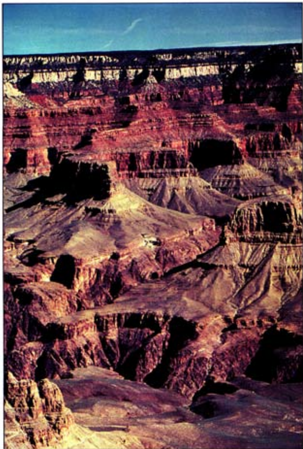
Figure 1.1 Grand Canyon of northern Arizona.